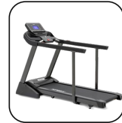
Optional Extended Handrails